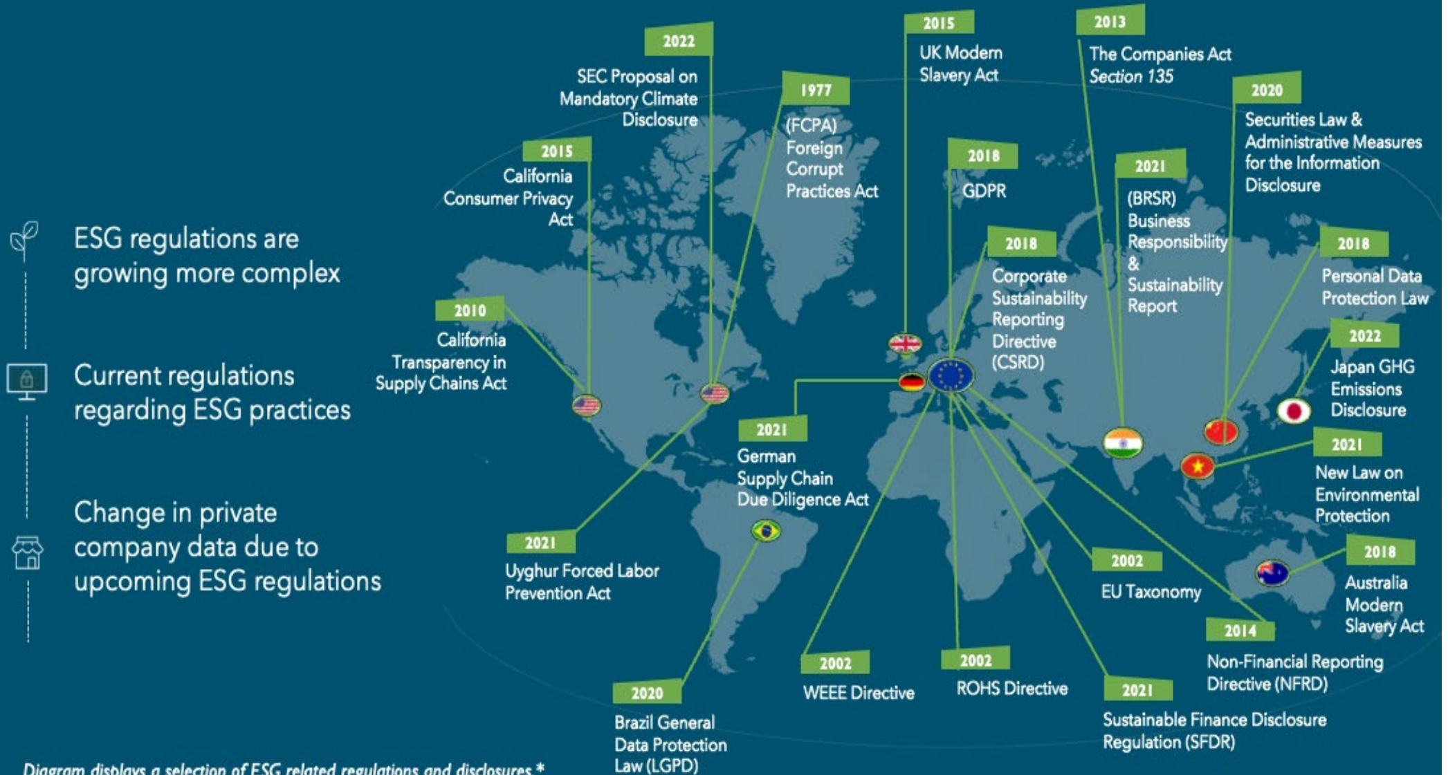
Diagram displays a selection of ESG related regulations and disclosures.*