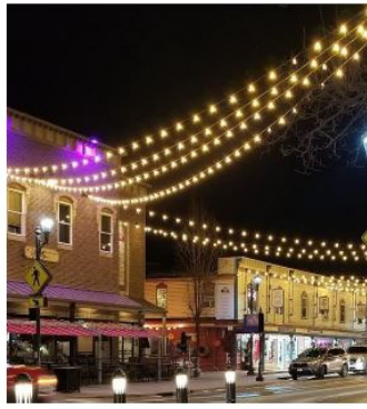
Alley in downtown Bangs. Add lights to enhance placemaking in the downtown.