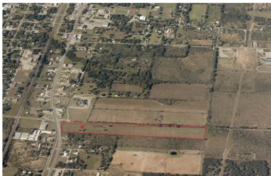
Recently annexed parcel outlined in red.