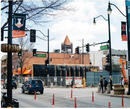
Champaign, Illinois, March 2019: Green Street and Sixth Street in Campustown

Approximately $30 million ($15 million of which came from a Federal TIGER grant) was invested in rebuilding Green Street as a three-lane and two-lane street which prioritized the pedestrian environment and included attractive street-scape amenities. In the years since the City began this process, private reinvestment in the Green Street corridor has been valued at over $600 million. None of this investment would have occurred without the City first investing in the area's infrastructure making it an attractive target of private investment.