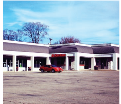
The Skyway Retail Center redevelopment was the original focus of the Corps' assignment

The team's strategy also emphasized creating a "destination" in the CBD, which already is home to a new business incubator. They advised active partnering with the Air Force base and Wright State University, creating activity-based entertainment venues and establishing a motorized trolley to enhance access to downtown. As for the Skyway Retail Center: the team believed a Citizen Services, Health and Wellness Center would be a successful development and convenient concentration of service businesses.