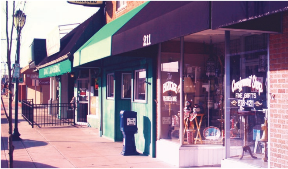
Downtown Fairborn: unique businesses in a historic setting