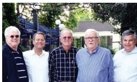
The CRE Consulting Corps Team.