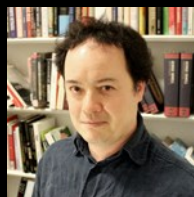
Graeme Wood The Atlantic Magazine New York, NY