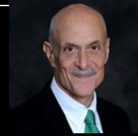
The Honorable Michael Chertoff Washington, DC

Secretary Chertoff's "on the line" experience managing risk after September 11 th and Hurricane Katrina, uniquely qualifies him to speak to the need for comprehensive risk-management strategies that can assess vulnerabilities, reduce risk exposure and mitigate potential consequences. A "Must Hear" for the world community regardless of nationality, professional specialty, or political leanings.