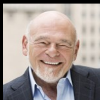
Sam Zell Equity Group Investments Chicago, IL

Where are the opportunities in these transformative times and where are the sinking ships? Perhaps, most important, why does Mr. Zell see recession on the horizon and what does he plan to do about it?