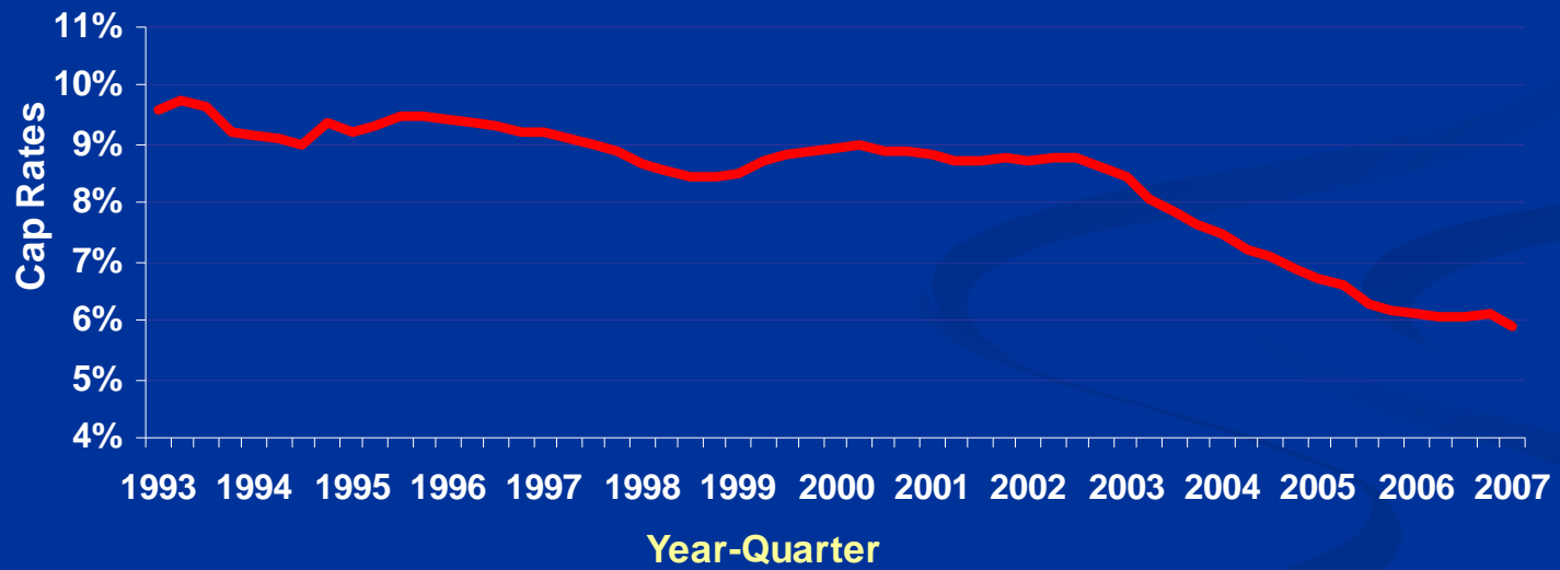
Transaction Cap Rates 4 Qtr Moving Average